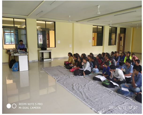
Expert Lecture on Introduction of Autocad (11/09/2019)